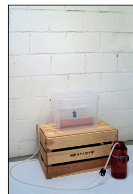
Buckets not included.